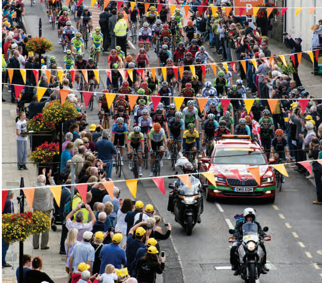
The Tour passes through Prudhoe

An application is under consideration by the Anglican Diocese of Newcastle for a faculty (permission) to be granted for the addition to the town's war memorial, at the entrance to St Mary Magdalene Parish Church, of the names of the following: (1) those from the area who fell in World War One, but are for a variety of reasons missing from the memorial (2) those who fell in World War Two (3) those who fell in post-1945 conflicts. If permission is granted, then for the first time all of those known to have made the ultimate sacrifice will be commemorated on the memorial, which was erected in 1922, funded by public subscription.