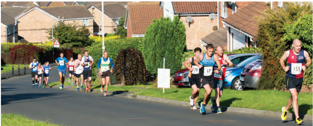
Prudhoe Miners' Race - the runners tackling the ascent of Beaumont Way

The 2016 races will take place on Sunday 25 September. Entries may be made using the following link: http://www.runnation.co.uk/sca-prudhoe-miners-run--junior-run-1039-p.asp