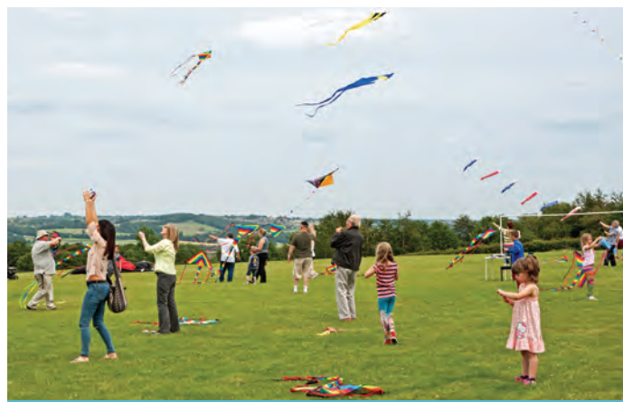
The spectacular Kite Festival

The 2015 Kite Festival took place at Highfield Park on 4 and 5 July. After a quiet Saturday, fine weather drew large, appreciative crowds on the Sunday to enjoy the superb spectacle of kite-flyers performing amazing feats in the Tynedale skies, both solo and in formations. The Council's grateful thanks again