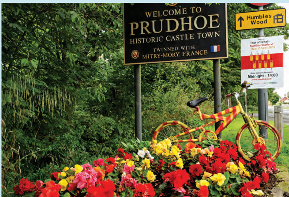
Prudhoe welcomes The Tour of Britain

Mayor / Chairman of Prudhoe Town Council.