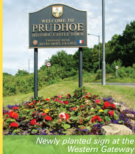
Newly planted sign at the Western Gateway

The Council thanks the following for their support in mounting the exhibition: Northumberland County Council (Library Service), English Heritage, The Co-operative (Prudhoe Garage branch), and Prudhoe Community Partnership.