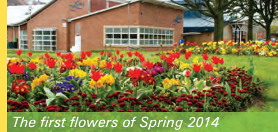
The first flowers of Spring 2014