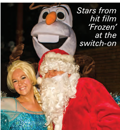
Stars from hit film 'Frozen' at the switch-on

2014 saw further work to enhance the festive appeal of the town centre with the installation of new displays, including a 'curtain' of lights over the front of the Glade, new wall-mounted 'bell' and 'holly' motifs, red, green and gold spheres, and additional white pea lights in the trees at Oaklands. On the day of the Switch-on, Friday 28th November, the excitement was palpable, and the festivities did not disappoint! The Spetchells Centre Christmas Fair got everything underway, and the Switch-on event led to the