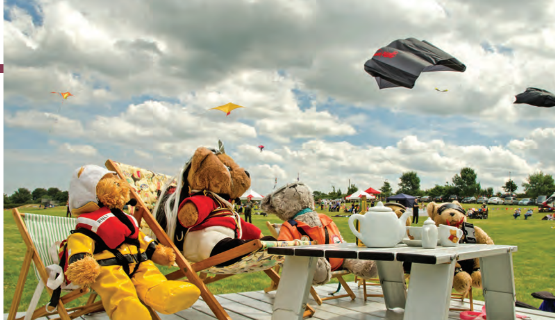
Kite Festival Parachuting teddy bears take time-out for tea at the Highfield Park Kite Festival